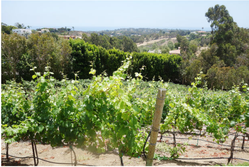
Southern California's newest American Viticulture Area, the Malibu Coast AVA, is tucked into the Santa Monica Mountains.